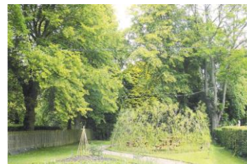
the outdoor classroom

as well as an organic fruit and vegetable patch there is an invertebrate safe haven, dubbed the 'bug hotel,' which houses an array of creepy crawlies.