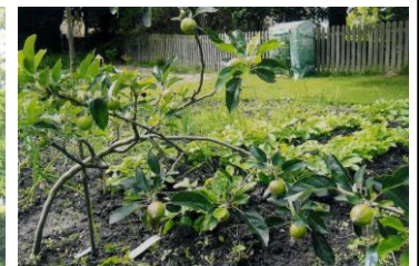
fruit & vegetable garden

Amy Chestnutt, HLC Biology Teacher says: 'We were absolutely delighted with how the presentation went. Sara praised the girls on their excellent work, and explained how they had met all the criteria necessary to create such a fantastic wildlife friendly garden.' One girl commented: "Our garden is so beautiful; everywhere you look there is something different and magical to see."